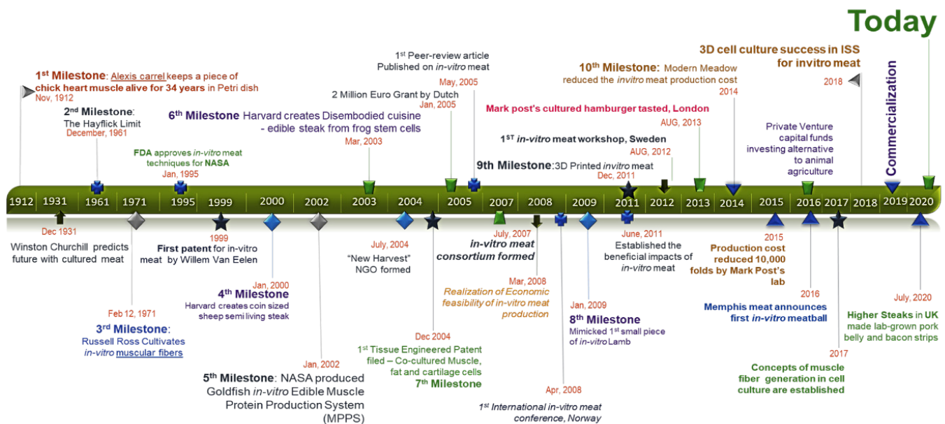
Fig. 2. Timeline of in vitro meat from start of cell culture to culture meat production.